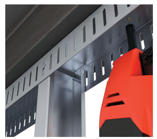
CFS to steel