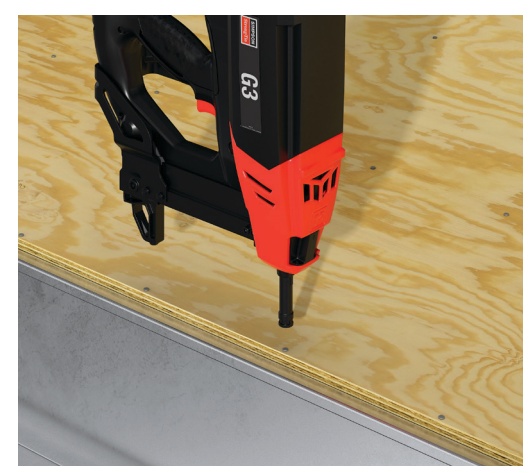
Plywood to CFS (or plywood to concrete or steel).