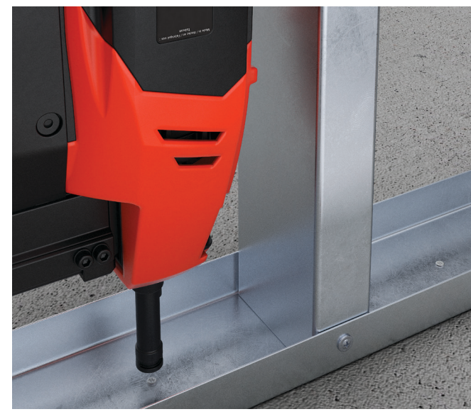
G3 Steel framing to concrete using GDP Pin.