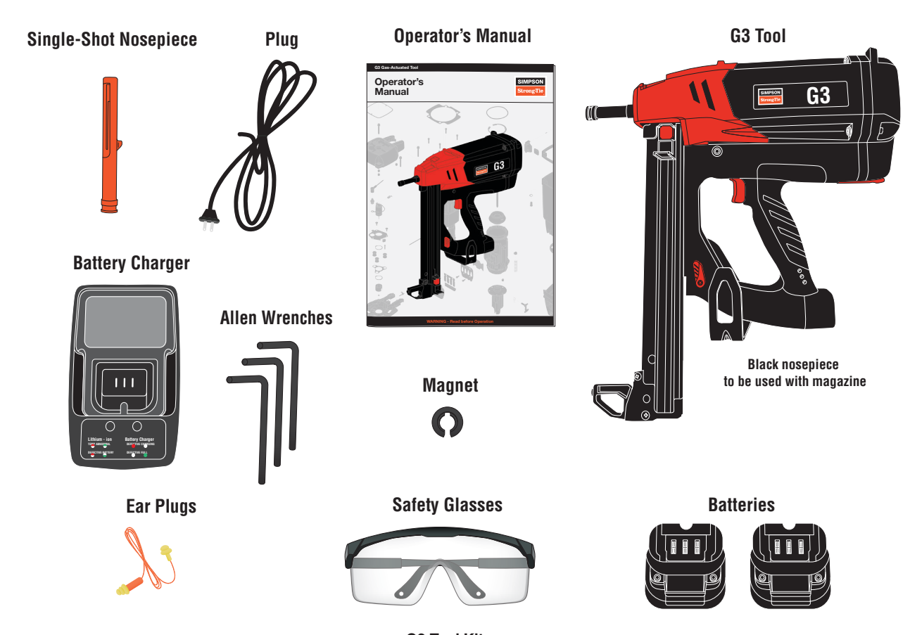
G3 Tool Kit

See strongtie.com for additional tool accessories and fastener suitability options.