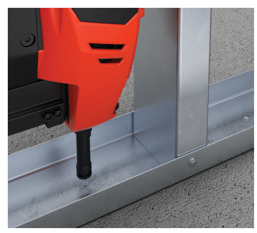
Cold-formed steel (CFS) to concrete.