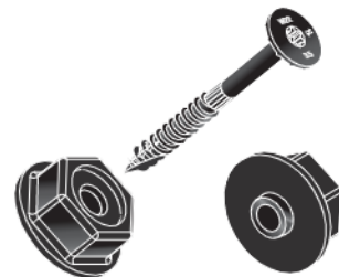
SDWS22312DBB (sold separately) with STN22 Hex-Head Washer