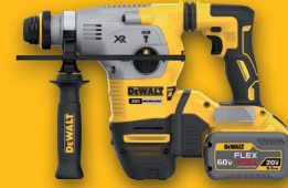
DCH293 1-1/8" 20V MAX** SDS Plus Rotary Hammer