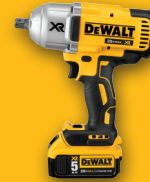
DCF899 1/2" 20V MAX** High Torque Impact Wrench